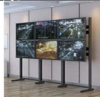
Multi-Monitor Display Floor Stands