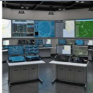
Security Desks | Heavy Duty