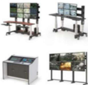
Security Control Room Computer Sit-