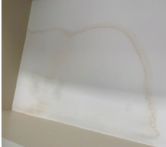
OFFICE # 216- 2 ND DECK