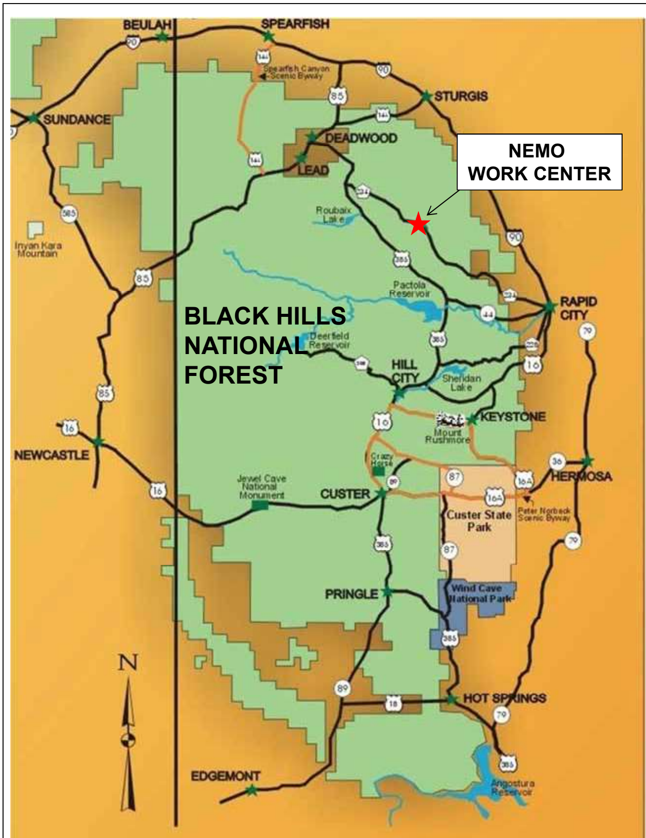
Figure 1-1 Black Hills Area Map USFS, Black Hills, South Dakota