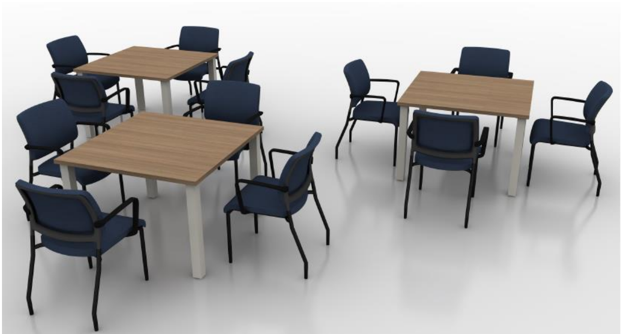
Figure 2: Break Room 127