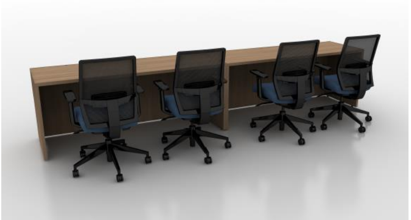
Figure 15: Support 150 and 167