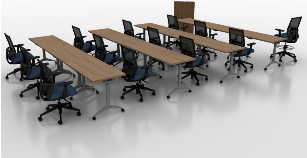
Figure 5: Classrooms 128, 131, 132, 133, 134, 135, 136, and 137