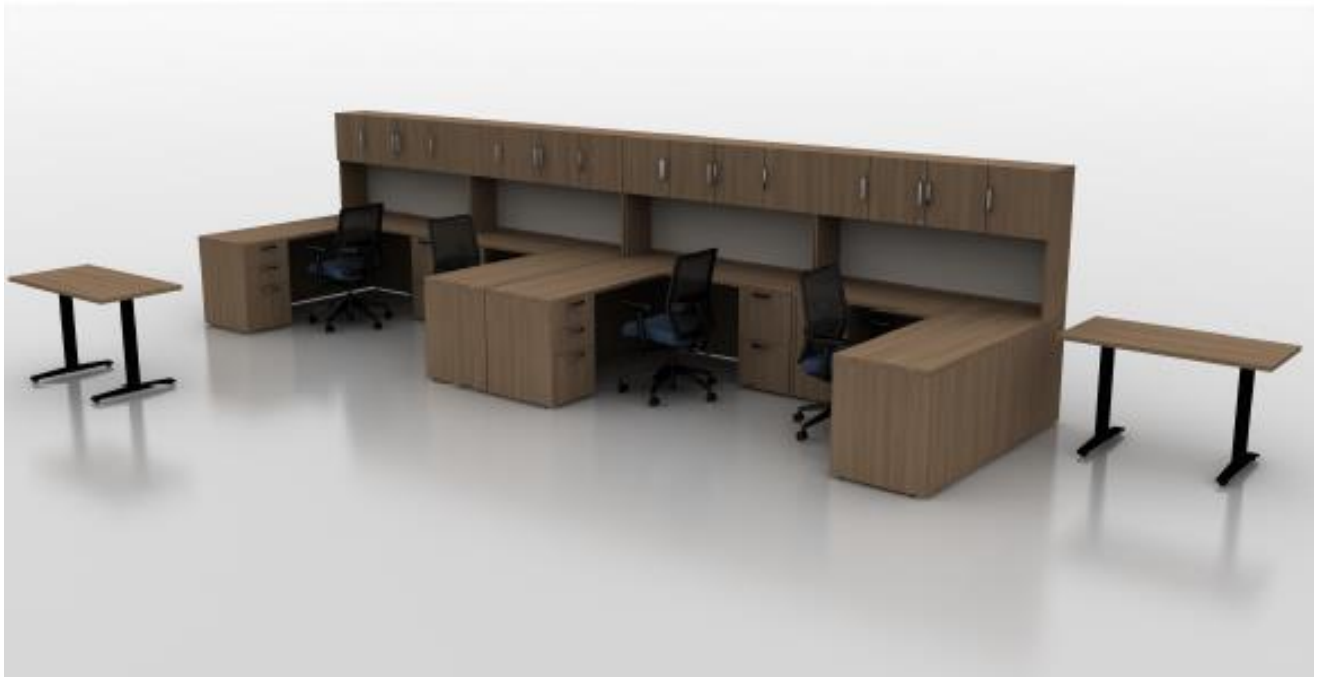
Figure 12: MX 104