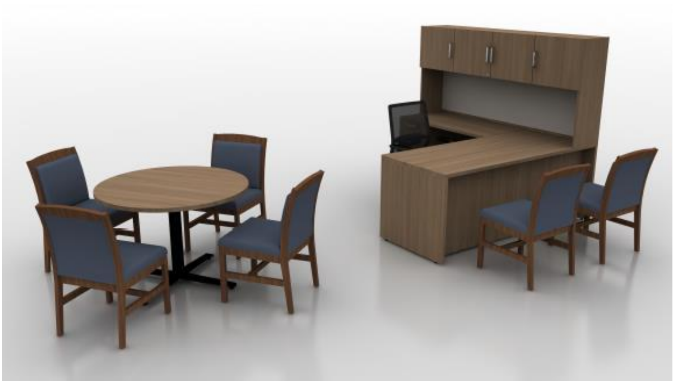
Figure 14: Scheduler 143