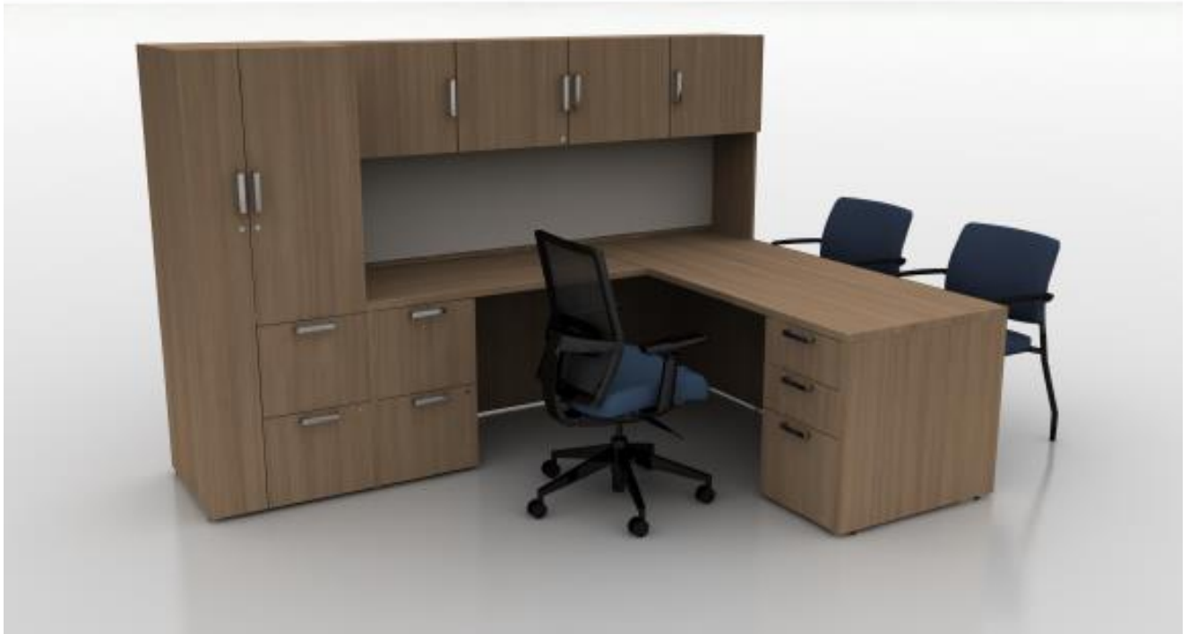
Figure 13: Office 103