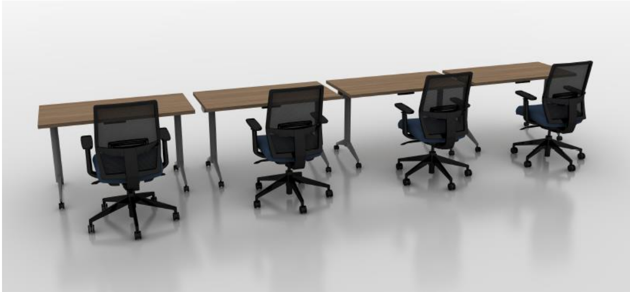
Figure 4: CBT Room 109