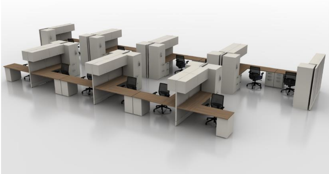
Figure 6: Instructor H Office 141