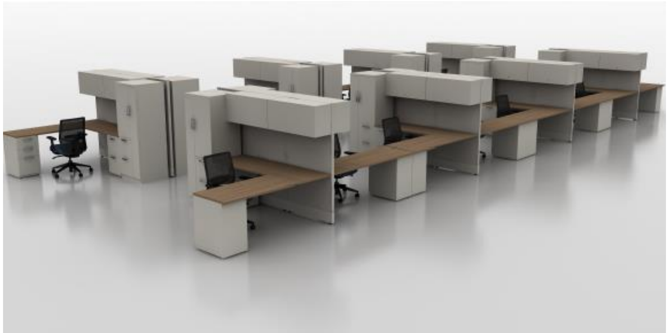
Figure 7: Instructor J Office 105