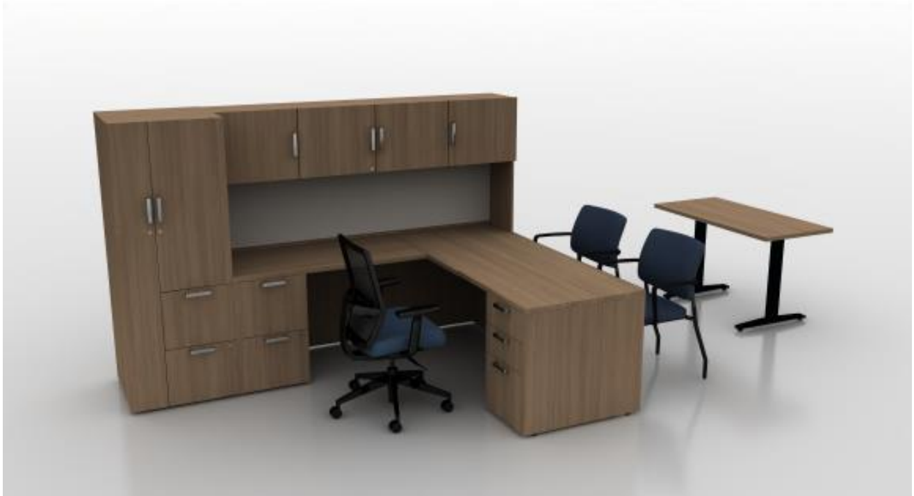
Figure 10: Maintenance Office 139