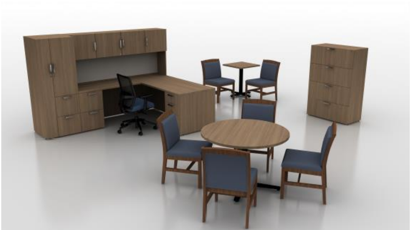
Figure 9: Lead Instructor 129