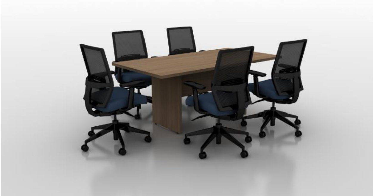
Figure 3: Briefing Rooms 106, 112, 114, 115, 116, 120, and 121; and Classroom 108 and LMPTT #1 and #2