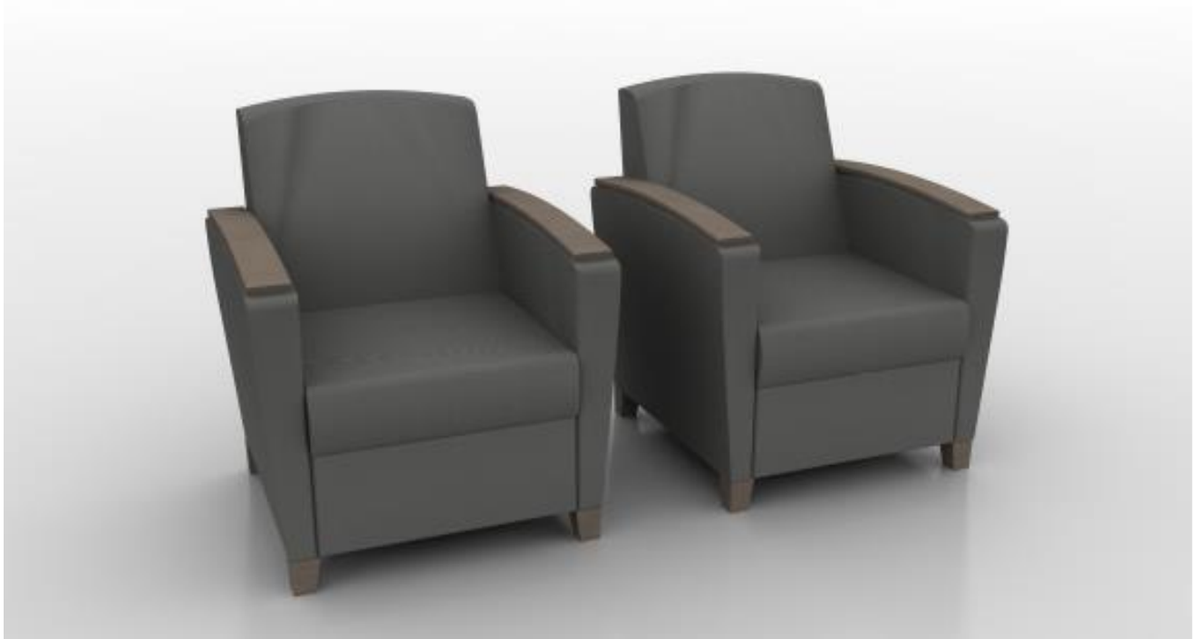
Figure 8: Lactation 125