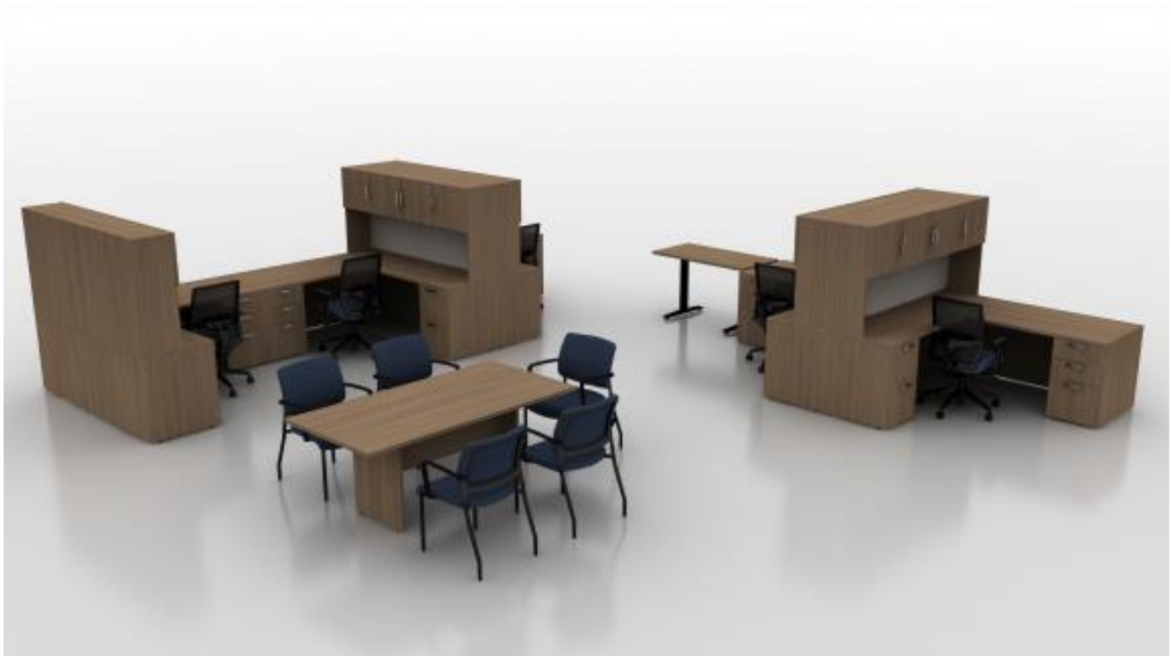
Figure 11: Maintenance Office 140