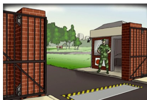
Expect to see a routine security posture