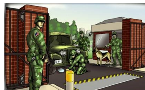
Expect rigorous efforts to inspect vehicles and facilities

You may be required to evacuate the base, or you will not be allowed on-base without escort