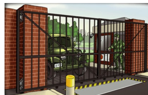
Expect to see closer inspection of vehicles and deliveries, ID checks, and A greater presence of guards on JB MDL