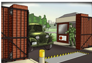
Expect random vehicle checks and increased crime prevention efforts