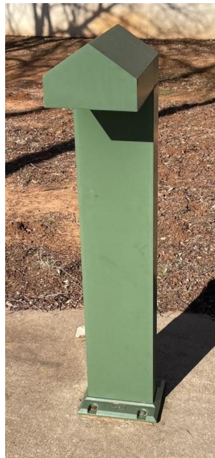
Existing Flag Pole Area Pathway Lighting Fixture