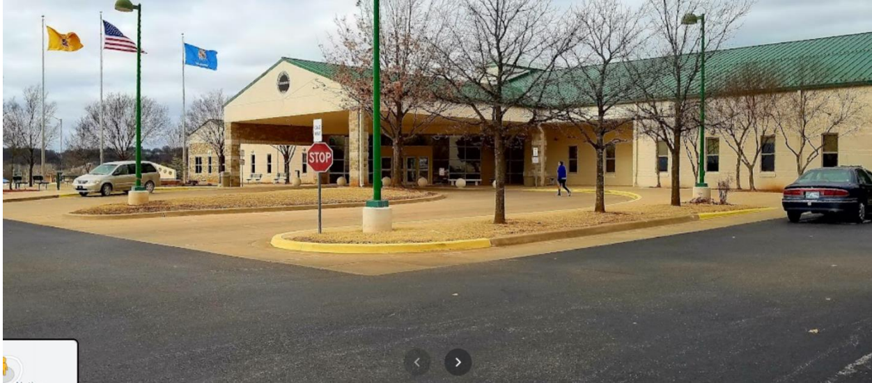
Flag Pole Area, Main Patient Entrance

Pawnee IHC - Flagpole Area Lighting Retrofit and Patient Entrance Signage OK3PAA01C6 Pawnee Indian Health Center Pawnee, Oklahoma