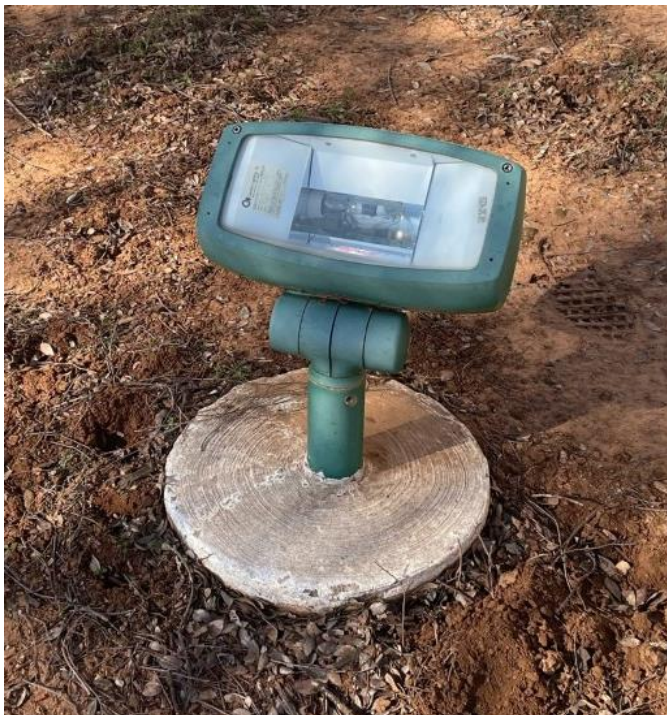
Existing Flag Pole Spot Lighting Fixture