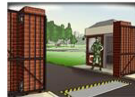
Expect to see a routine security posture