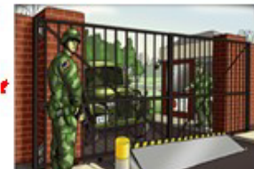
On-base: Follow security forces instructions – You may be directed to evacuate or seek shelter Off-base: You may be denied access until the incident is over Additional security measures will delay and interrupt normal routines