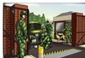
Expect rigorous efforts to inspect vehicles and facilities You may be required to evacuate the base, or you will not be allowed on-base without escort