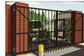
Expect to see closer inspection of vehicles and deliveries, ID checks, and A greater presence of guards on JB MDL