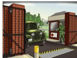
Expect random vehicle checks and increased crime prevention efforts