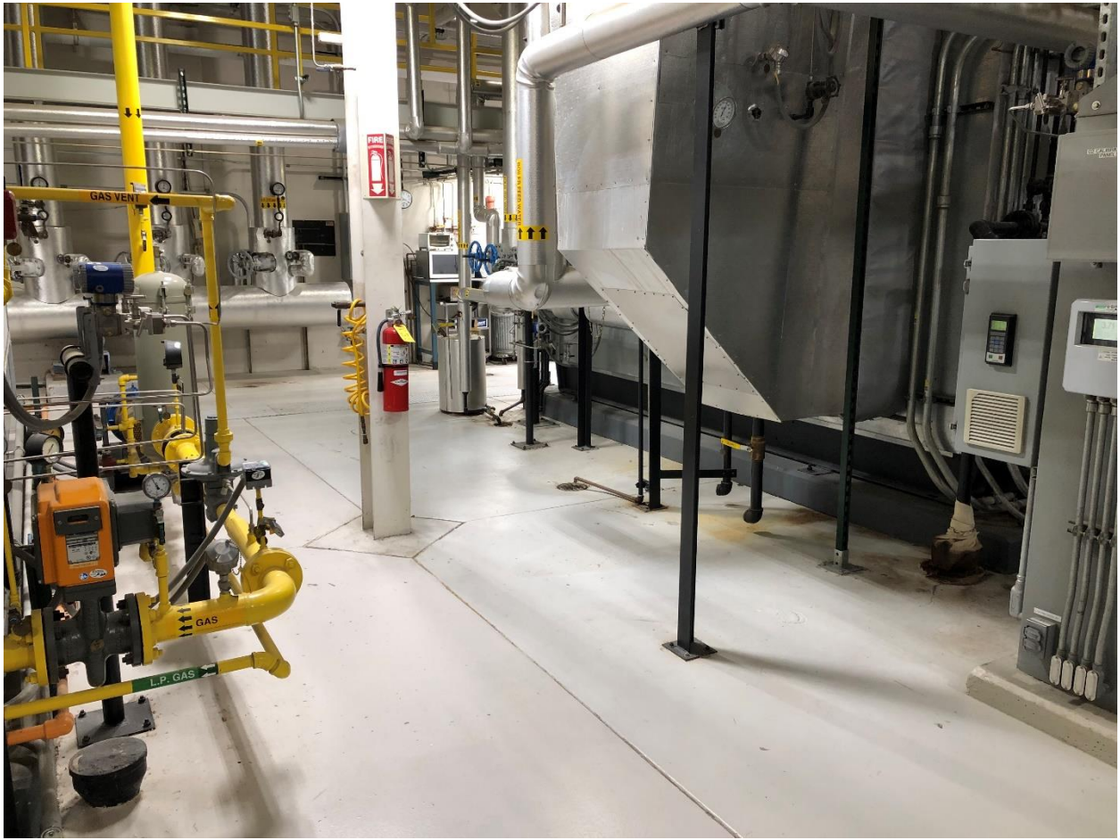
GROUND FLOOR BETWEEN BOILER 1 AND 2