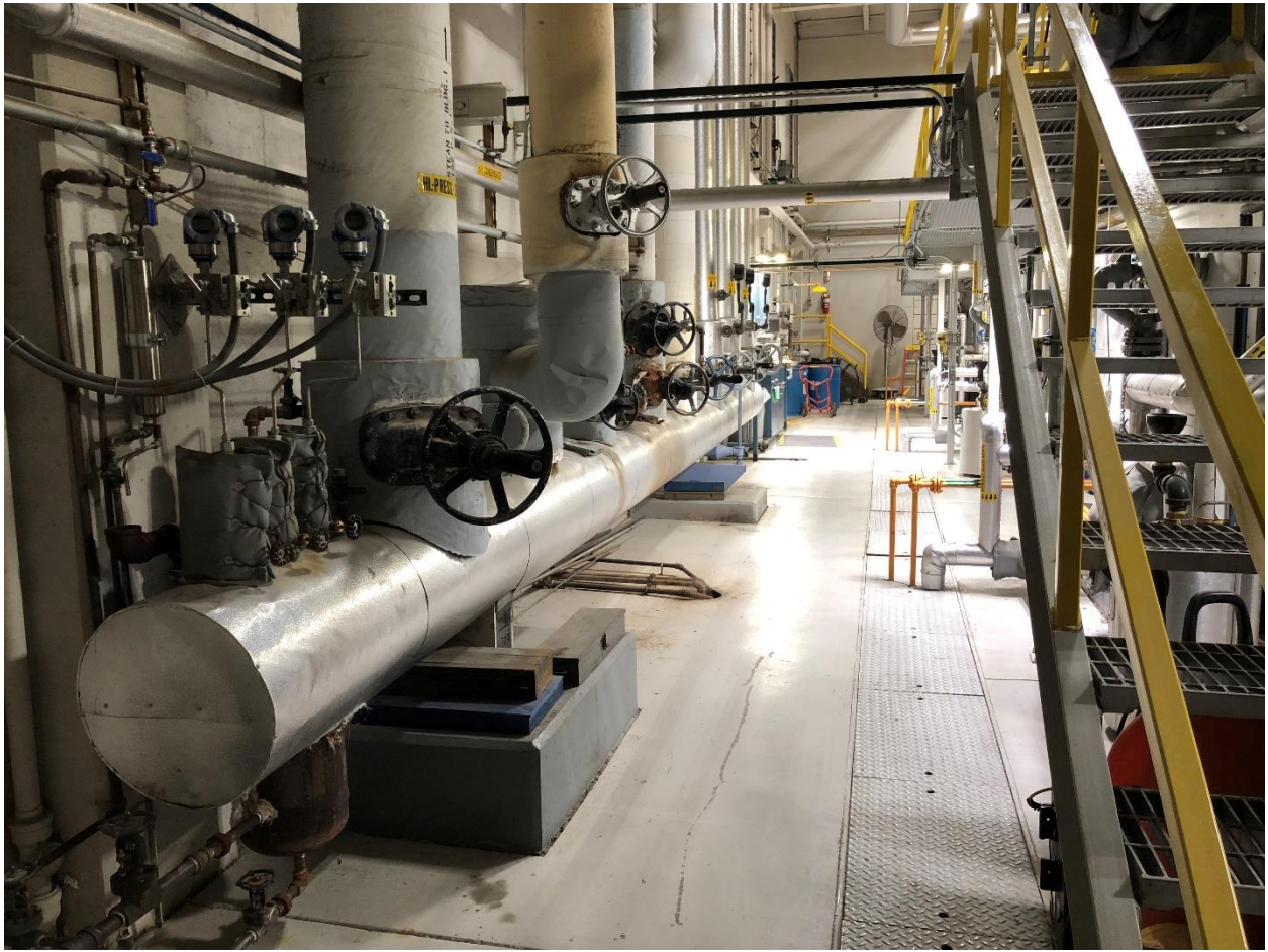
GROUND FLOOR BEHIND BOILERS