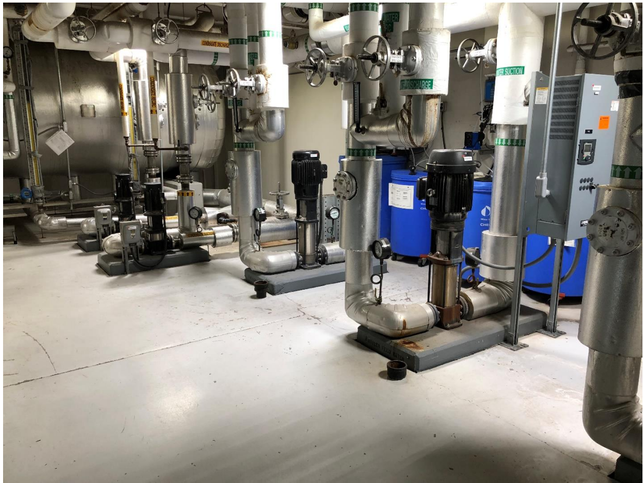
GROUND FLOOR PUMP AREA