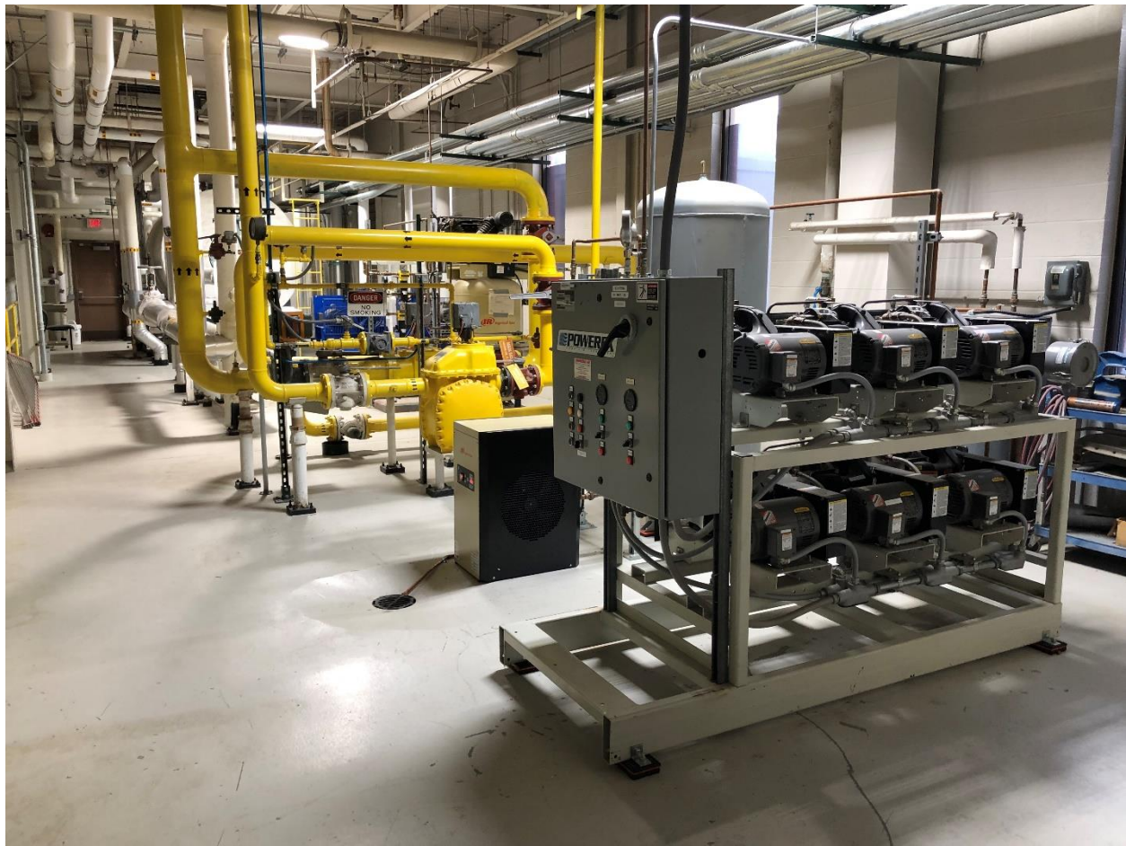
FIRST FLOOR MEZZANIE