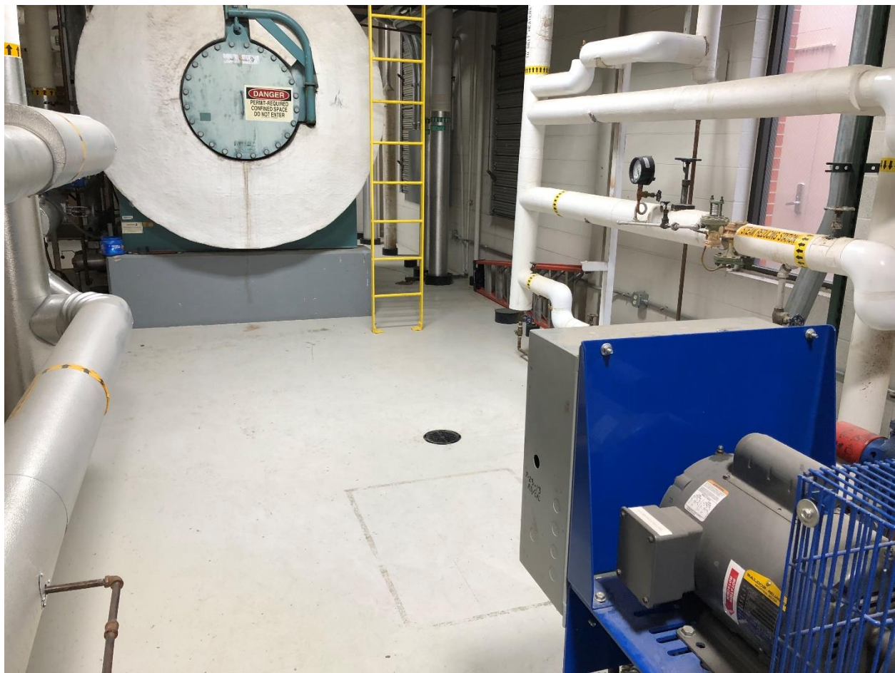
FIRST FLOOR MEZZANINE DA TANK AREA