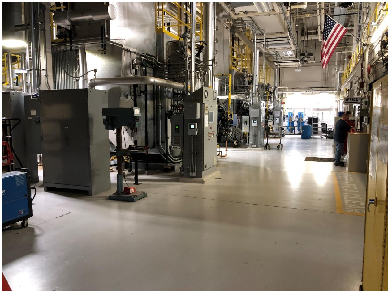
GROUND FLOOR FRONT OF BOILERS