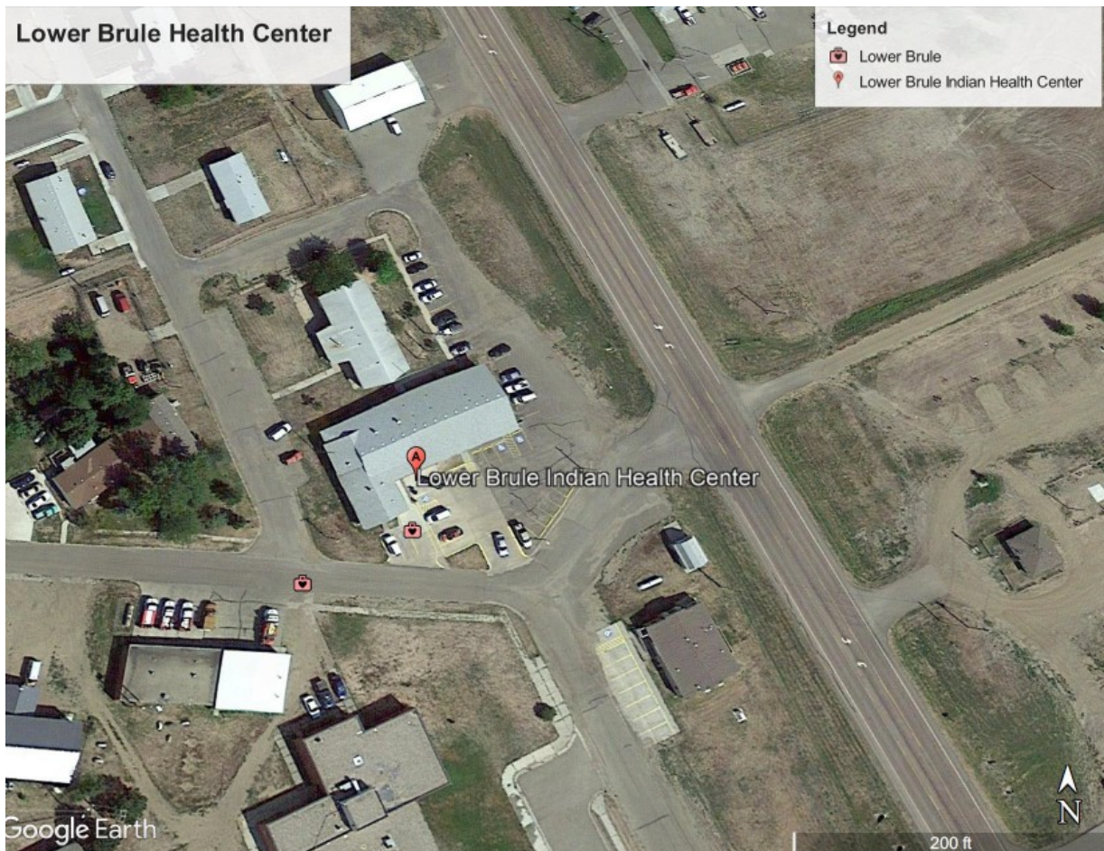
TAB A-2 SERVICE UNIT MAP