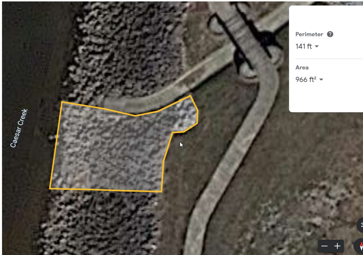
Over view of area to be grouted.