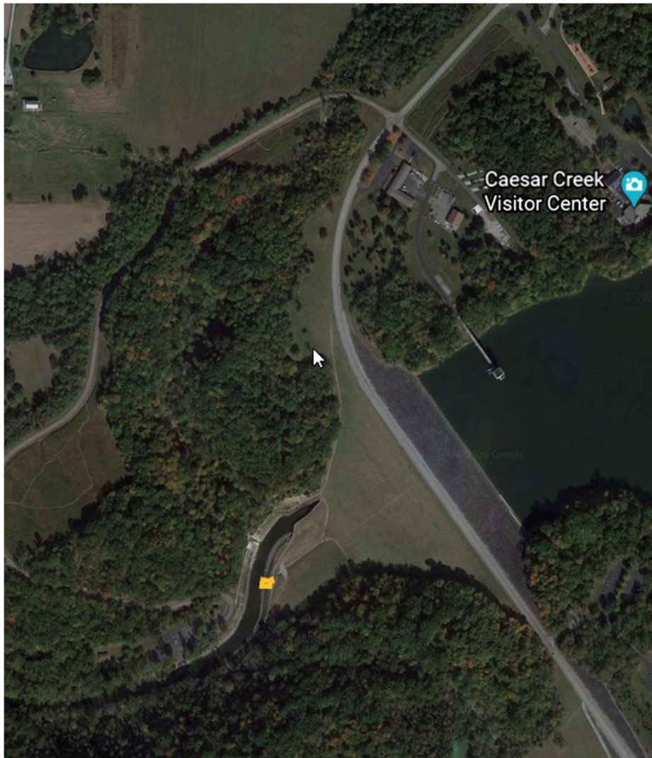
Access road for equipment to get to Slush grout area.