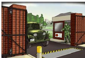
Expect random vehicle checks and increased crime prevention efforts