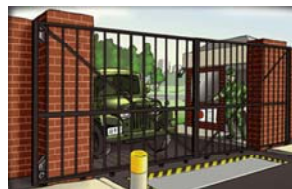
Expect to see closer inspection of vehicles and deliveries, ID checks, and A greater presence of guards on JB MDL