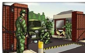
Expect rigorous efforts to inspect vehicles and facilities

You may be required to evacuate the base, or you will not be allowed on-base without escort