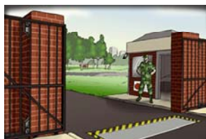
Expect to see a routine security posture