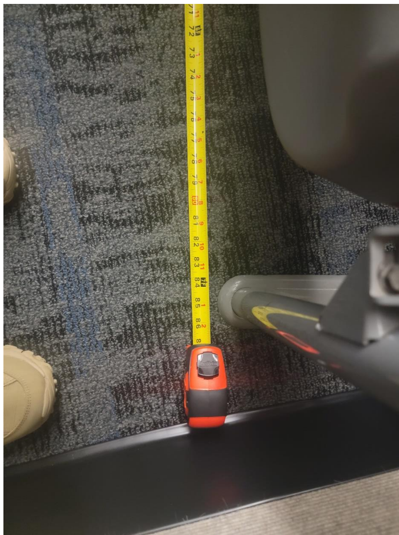
Length of 4-seat rom 2