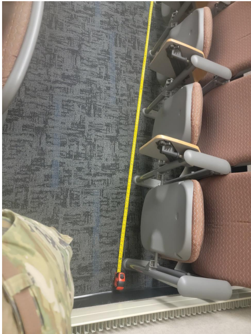
Length of 4-seat row1