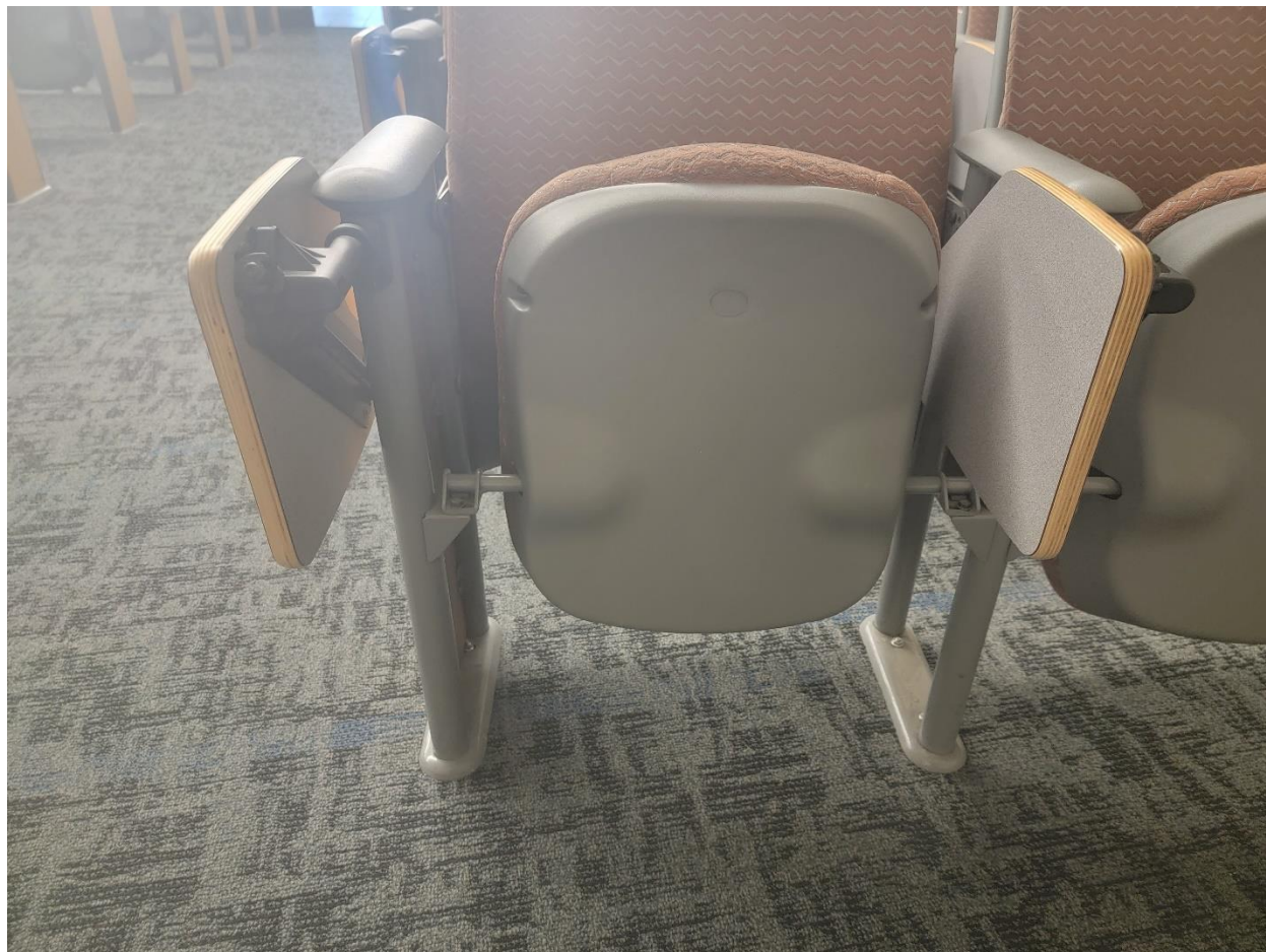
Front view of seats