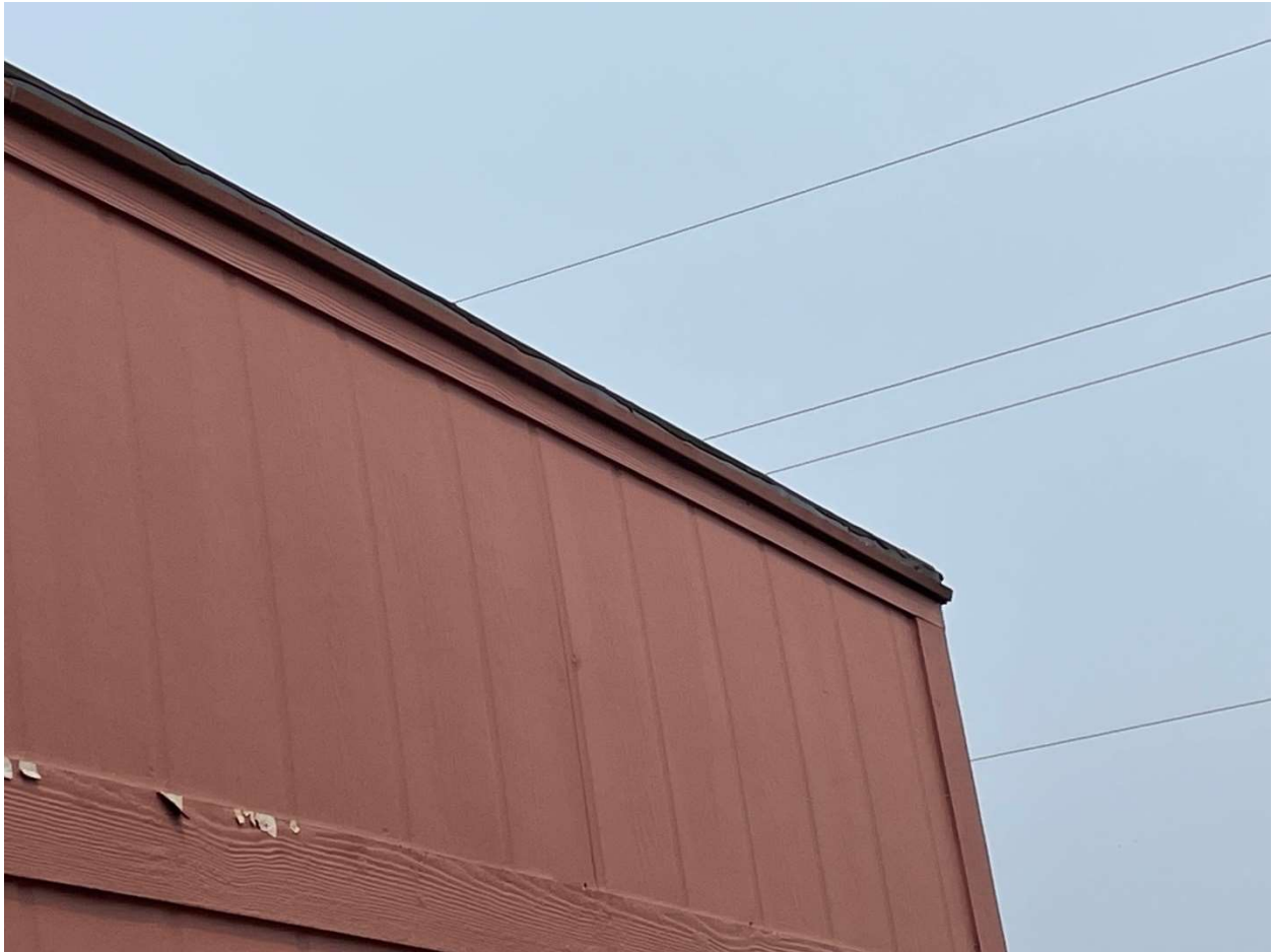
Showing extended roofing east side Face of the Office Building-3