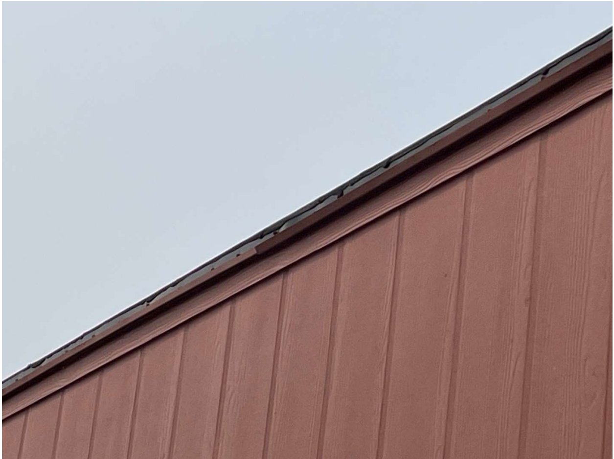
Showing extended roofing east side Face of the Office Building-4