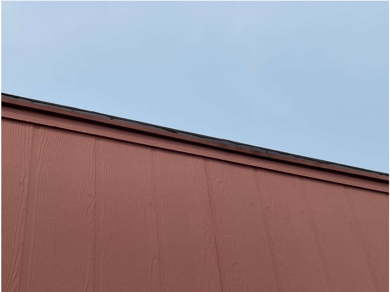
Showing extended roofing east side Face of the Office Building-1