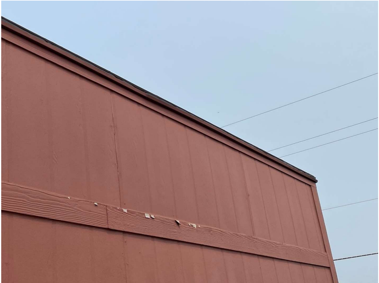
Showing extended roofing east side Face of the Office Building-2