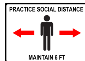
Maintain Social Distance Foamboard Sign 14" x 10"