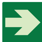
Directional Arrow Sign PVC 8" x 8"