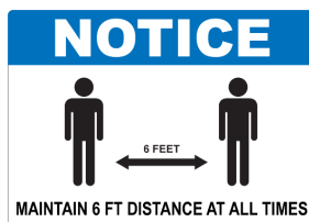
Social Distance Notice Foamboard Sign 14" x 10"