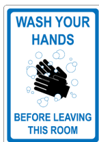
Wash Your Hands Foamboard Sign 7" x 10"