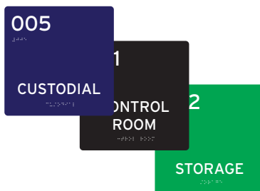
ADA Room Name and Number Plastic 8" x 8"