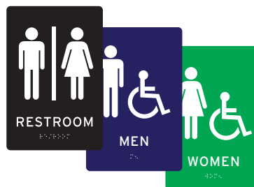
ADA Restroom Sign Plastic 6" x 9"