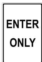
Enter Only Polymetal Sign 12" x 18"