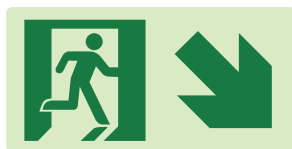
Running Man with Arrow Sign PVC 12" x 6"