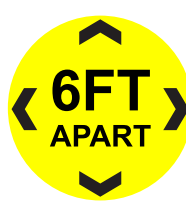
6 Ft Apart Vinyl Decal 8" diameter Pack of 10