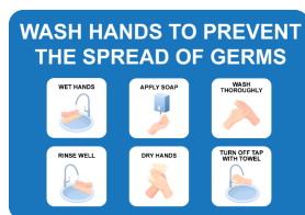
Hand Washing Instructions Foamboard Sign 10" x 7"