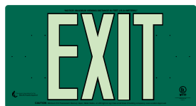
Photoluminescent Exit Sign Polymetal and Lucite 50' and 100' Visibility