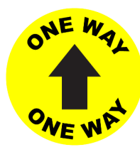
One Way Arrow Vinyl Decal 8" diameter Pack of 10