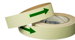
Photoluminescent Tape with Arrows 25' Rolls 50' Rolls