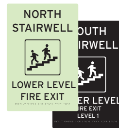
ADA Stairwell Sign Plastic 12" x 18"