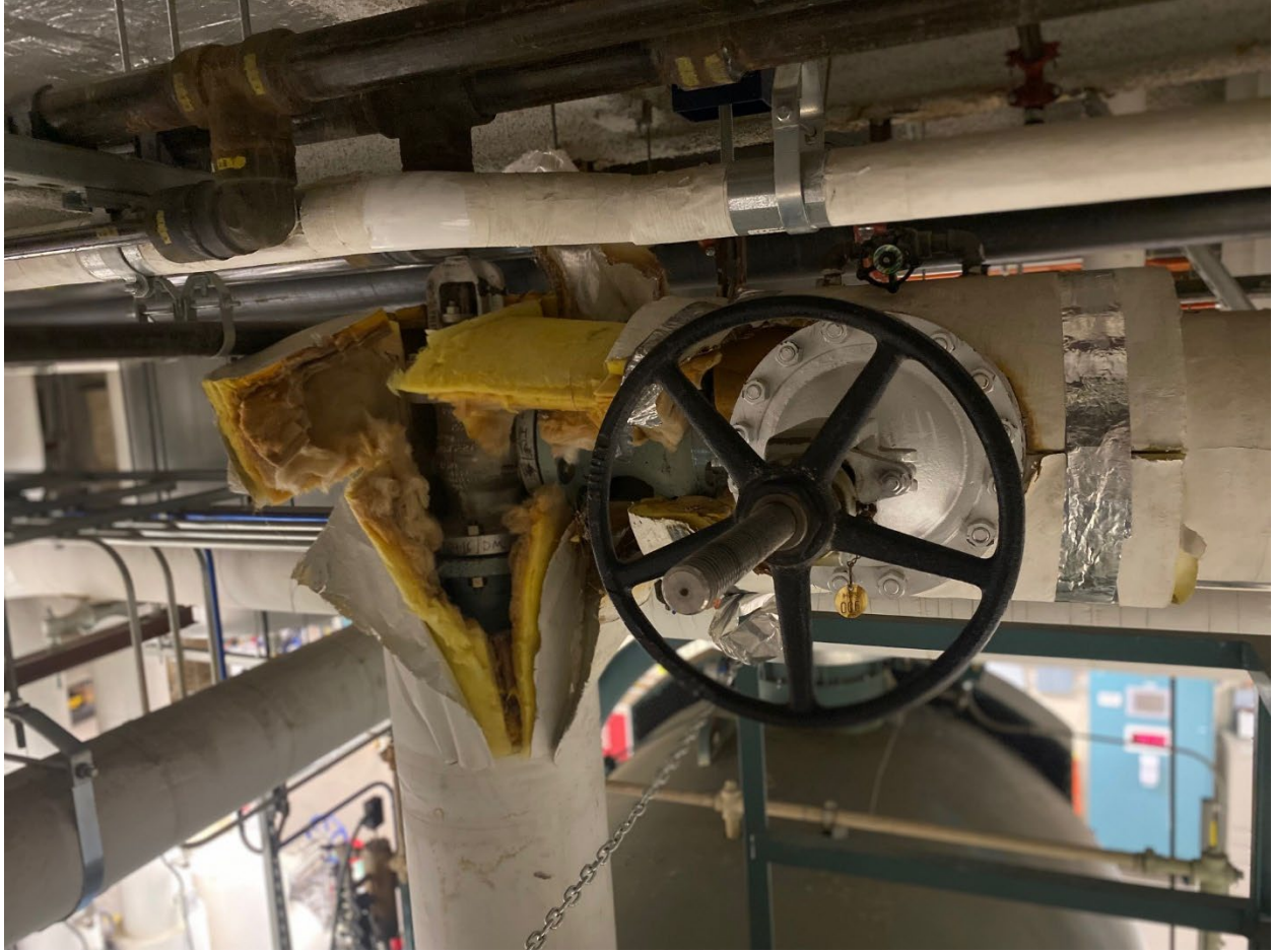
Figure 8: Boiler Discharge Valves and Startup Bypass