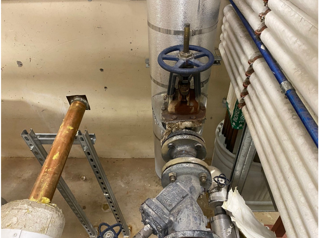
Figure 12: 6-DHX-2 Steam Isolation Gate Valve and Y-Strainer