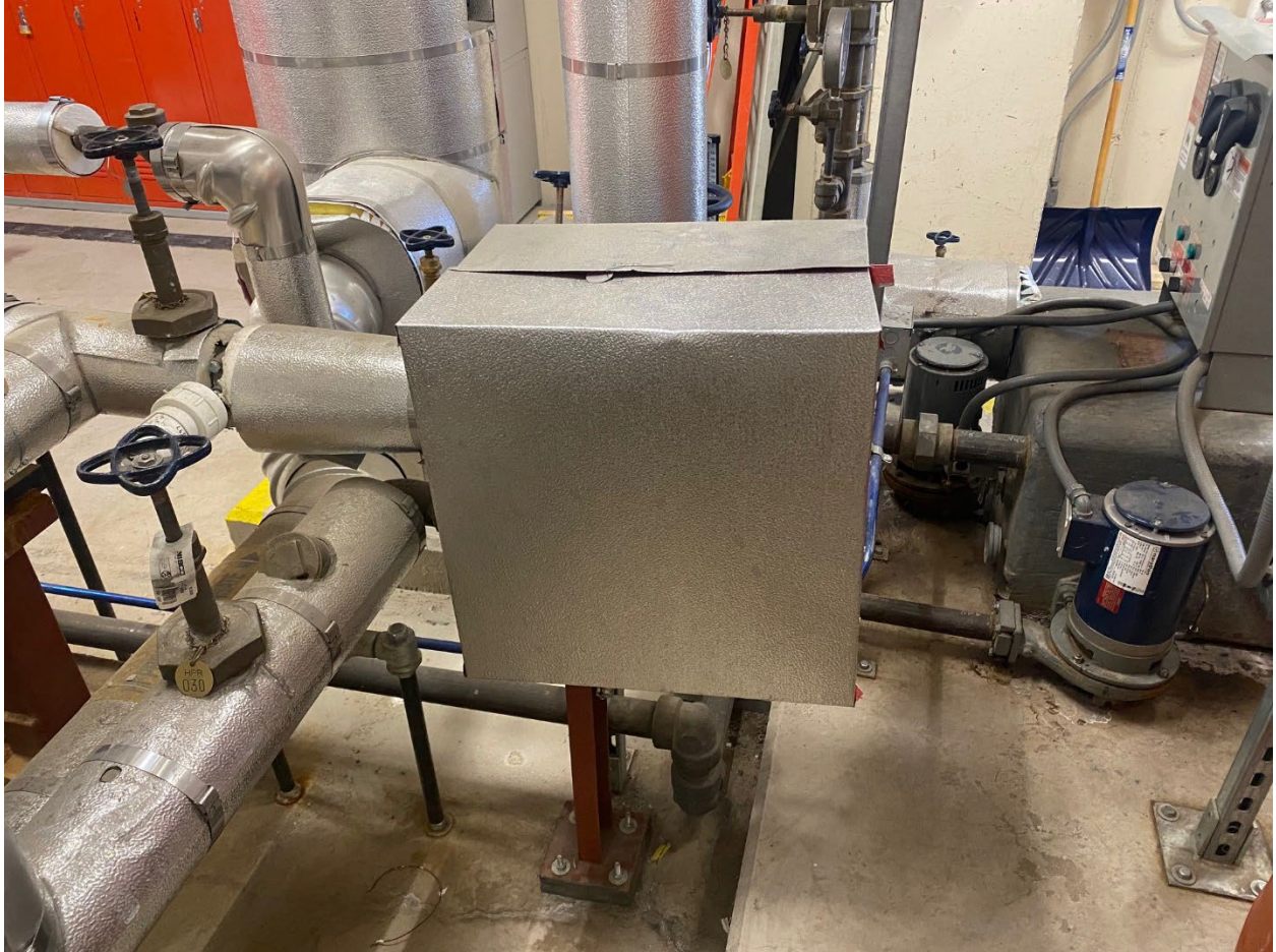
Figure 21: 6-DHX-1 Water Heater Trap and Y-strainer