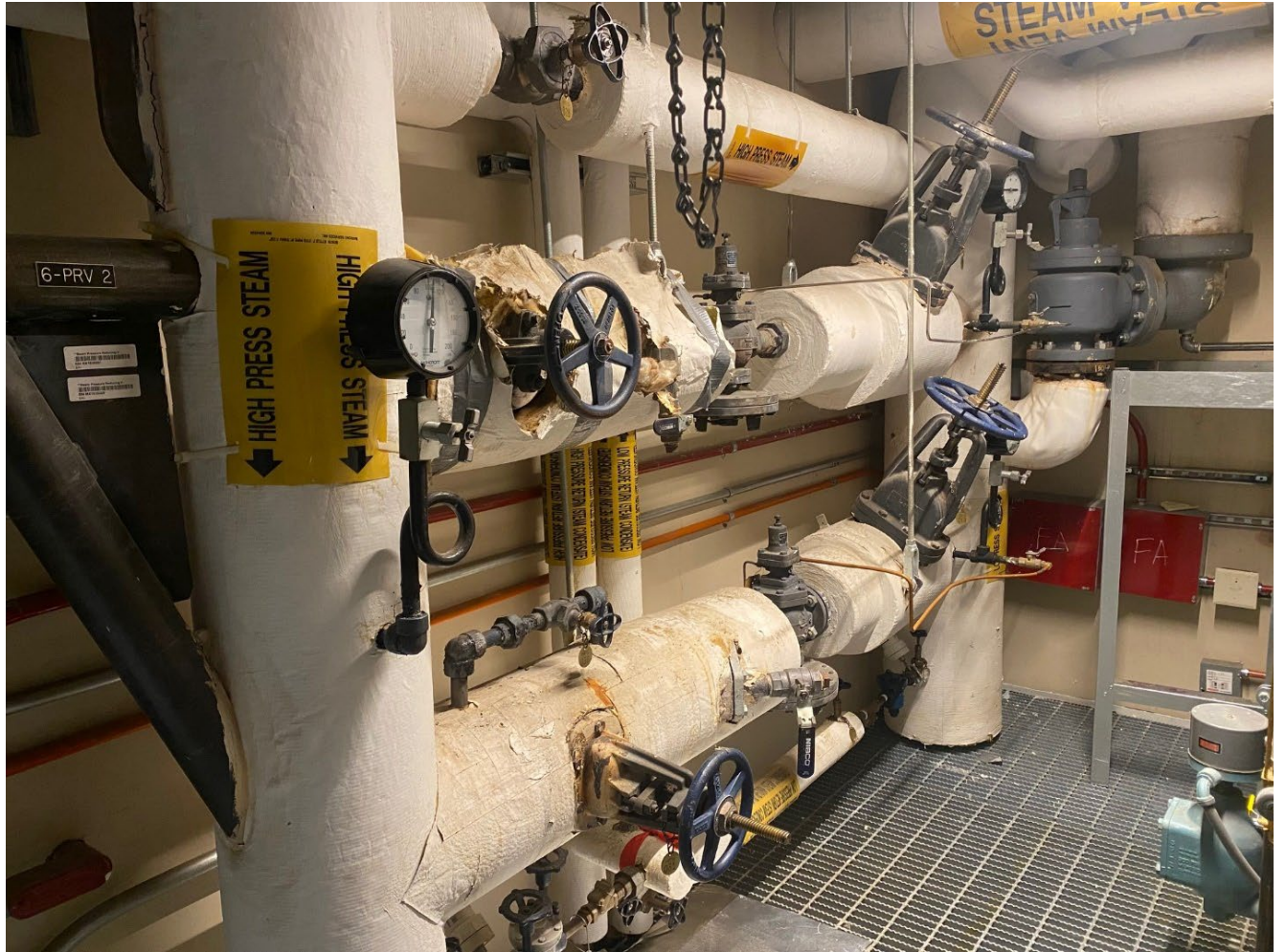
Figure 2: PRV Station 6-PRV-2