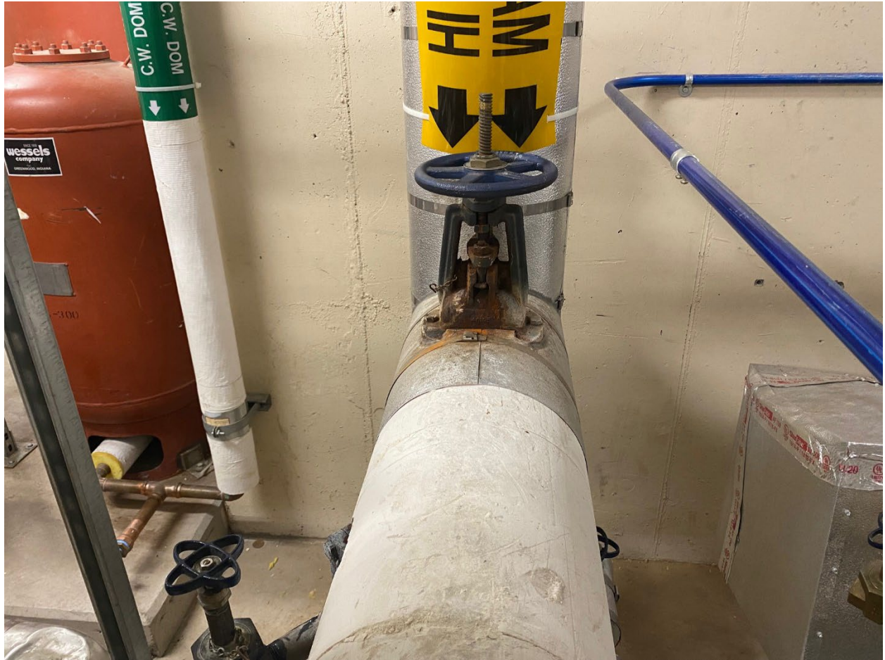
Figure 14: 6-DHX-1 Steam Isolation Gate Valve and Y-Strainer