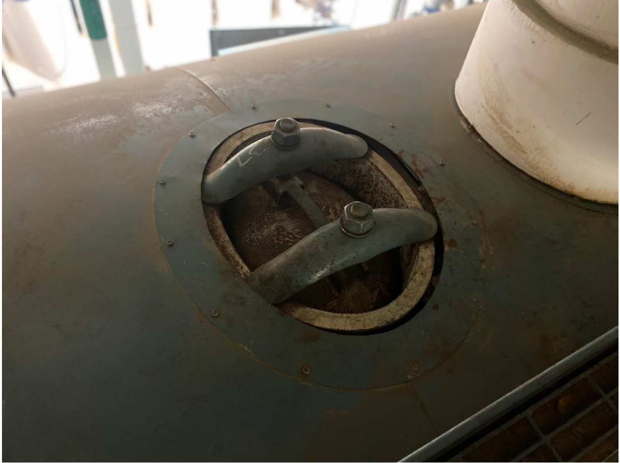
Figure 9: Boiler Top Access Port