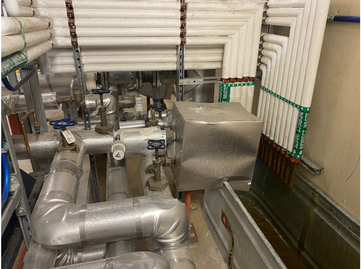
Figure 19: 6-DHX-3 Water Heater Trap and Y-strainer