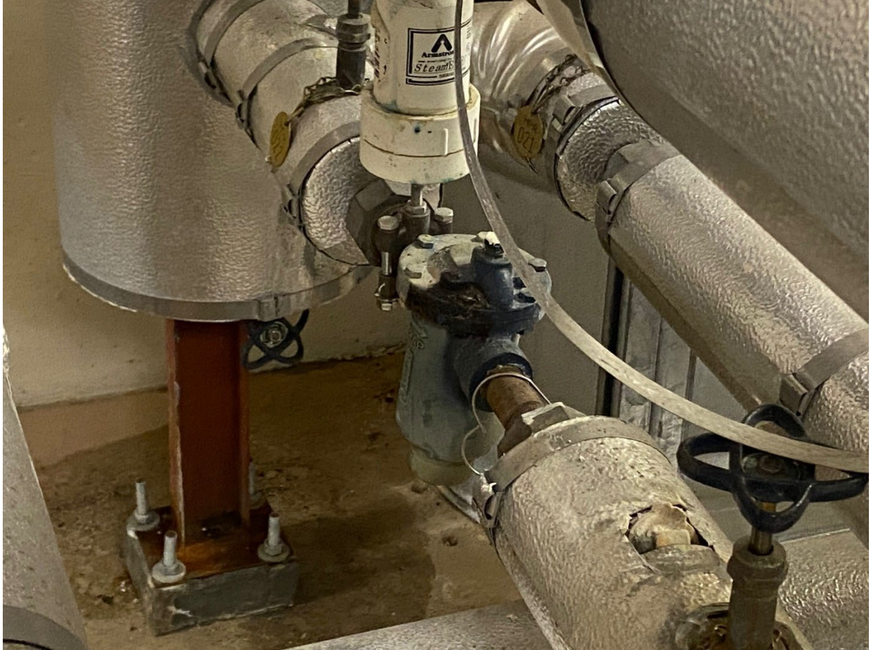
Figure 17: 6-DHX-2 Drip Leg Trap