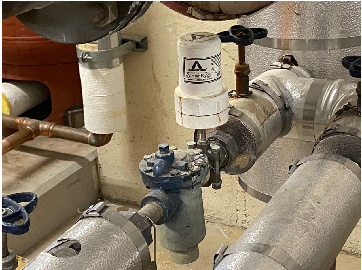
Figure 16: 6-DHX-1 Drip Leg Trap