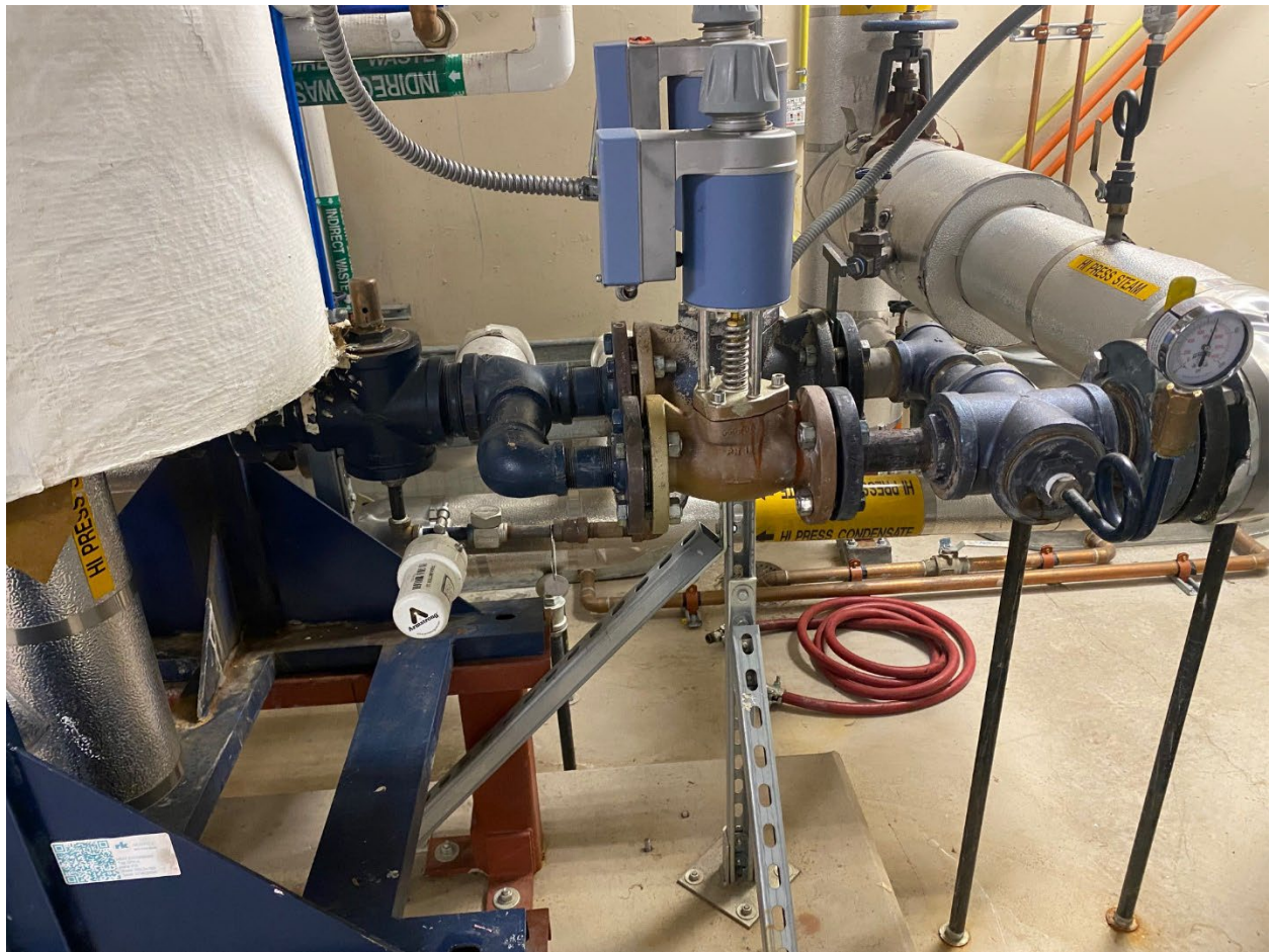
Figure 10: 6-DHX-3 Control Valves and Trap