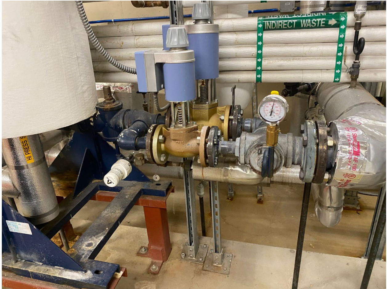
Figure 13: 6-DHX-2 Control Valves and Trap