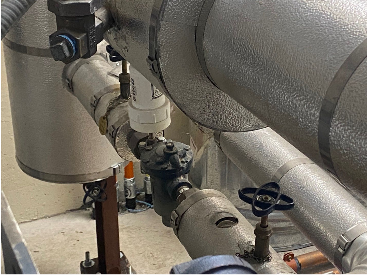
Figure 18: 6-DHX-3 Drip Leg Trap