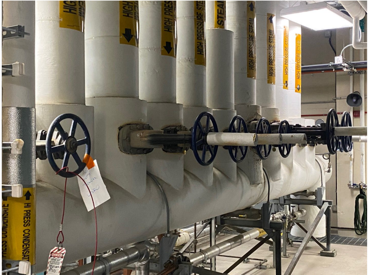
Figure 4: Steam Header Right Side