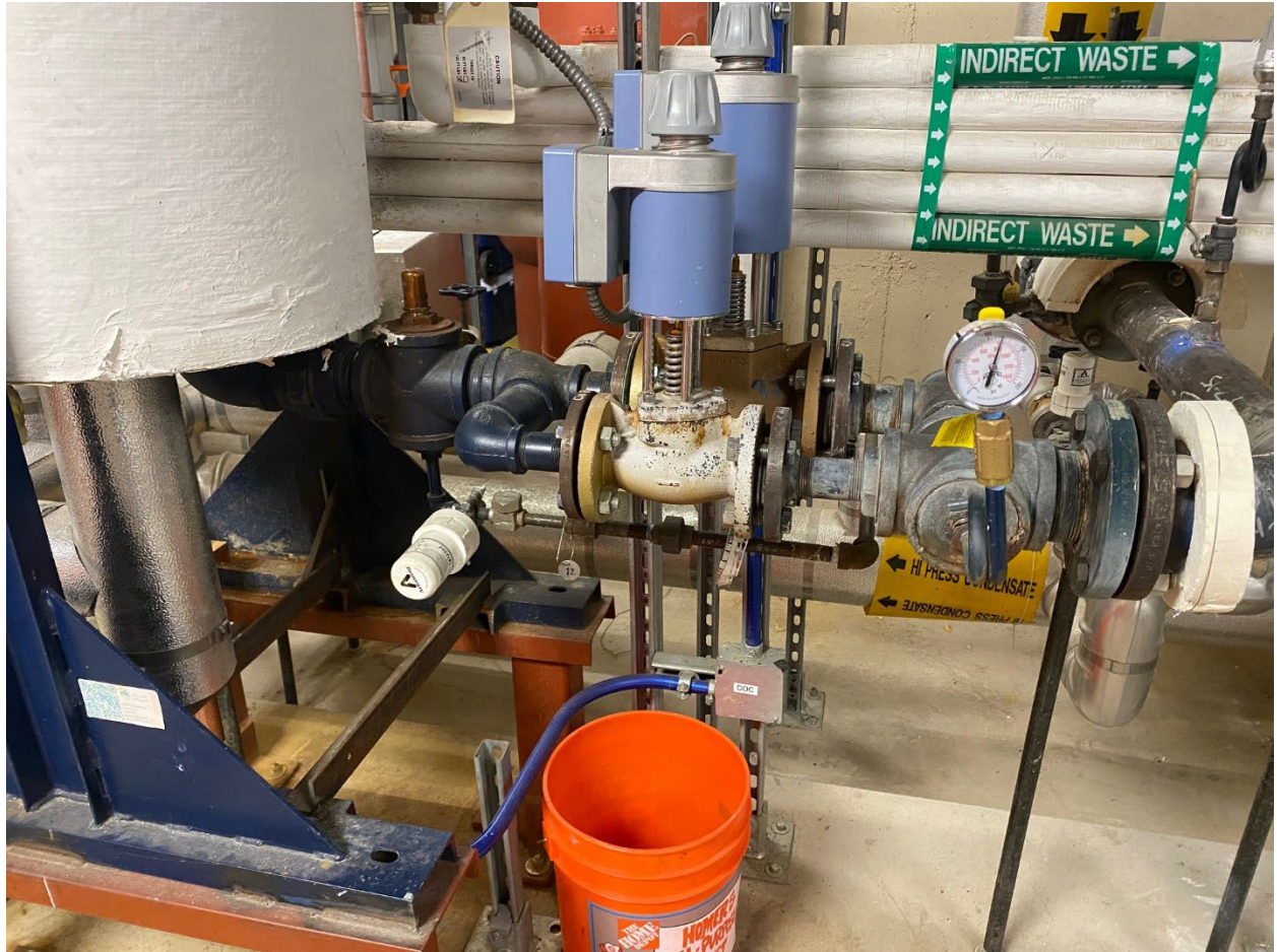
Figure 15: 6-DHX-1 Control Valves and Trap