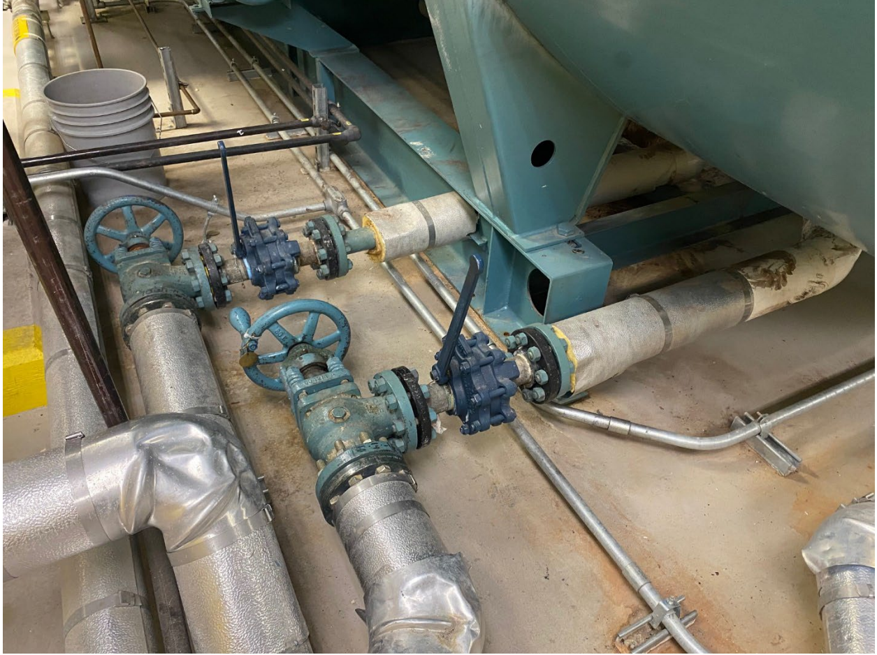
Figure 5: Boiler Blowdown Valves