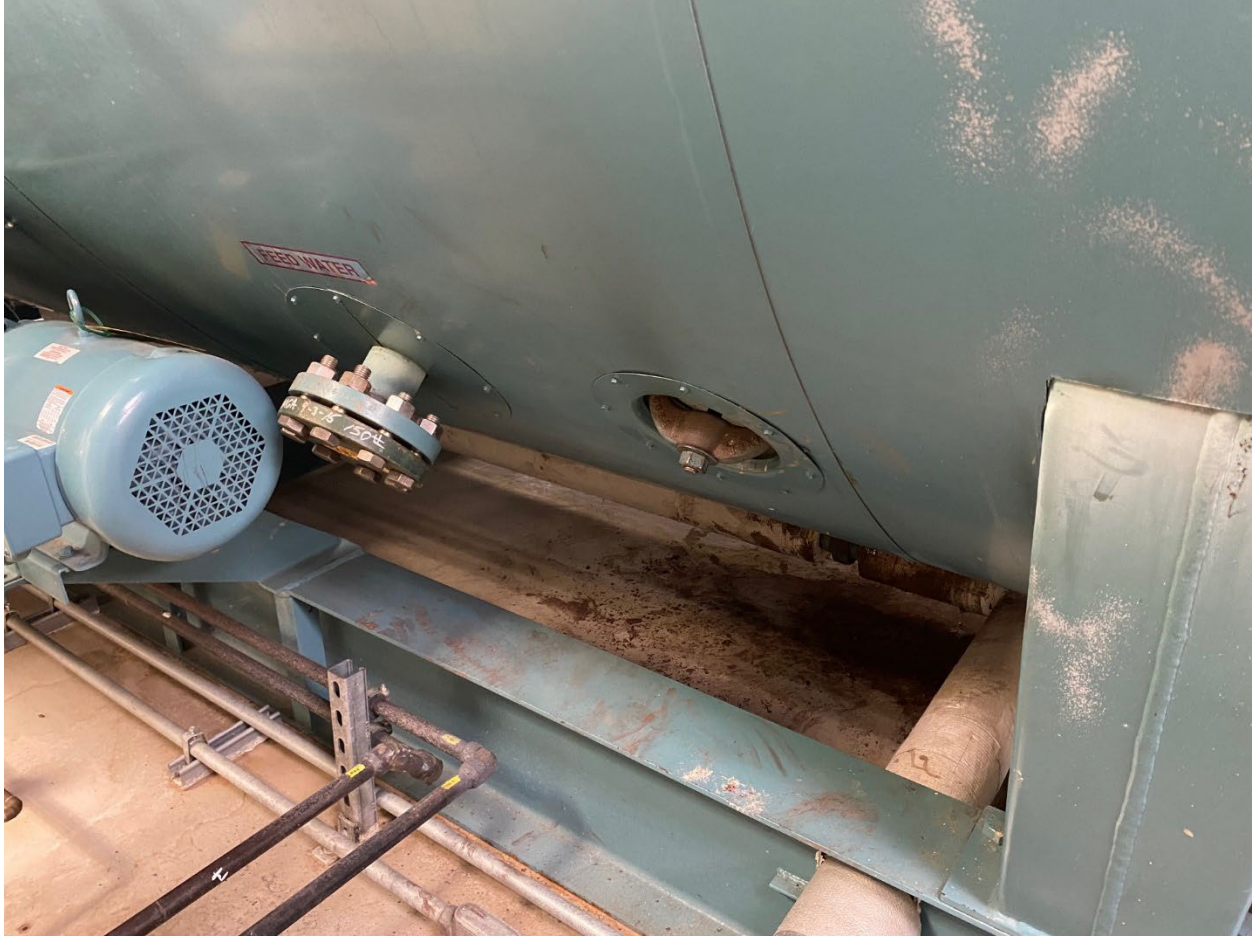
Figure 6: Boiler Flanged Port and Hand Access Port