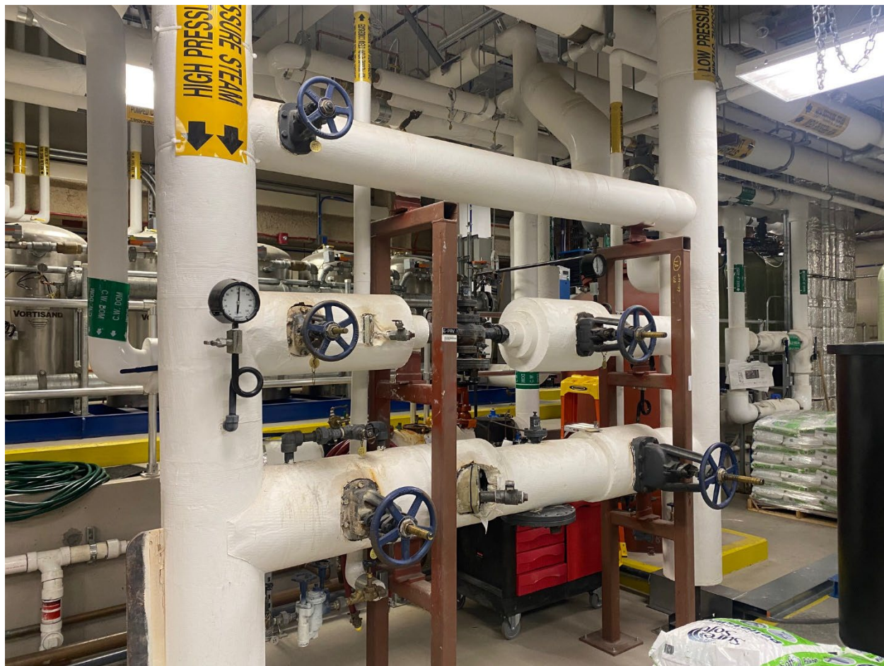
Figure 1: PRV Station 6-PRV-1

Pictures for 554-23-109 Install New Jackets on Valves and Traps