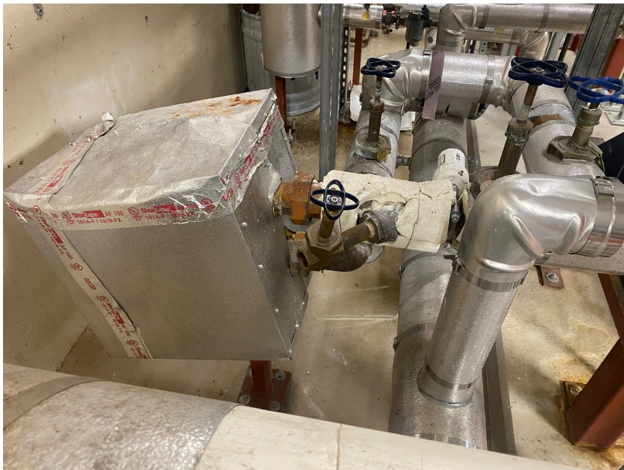
Figure 20: 6-DHX-2 Water Heater Trap and Y-Strainer