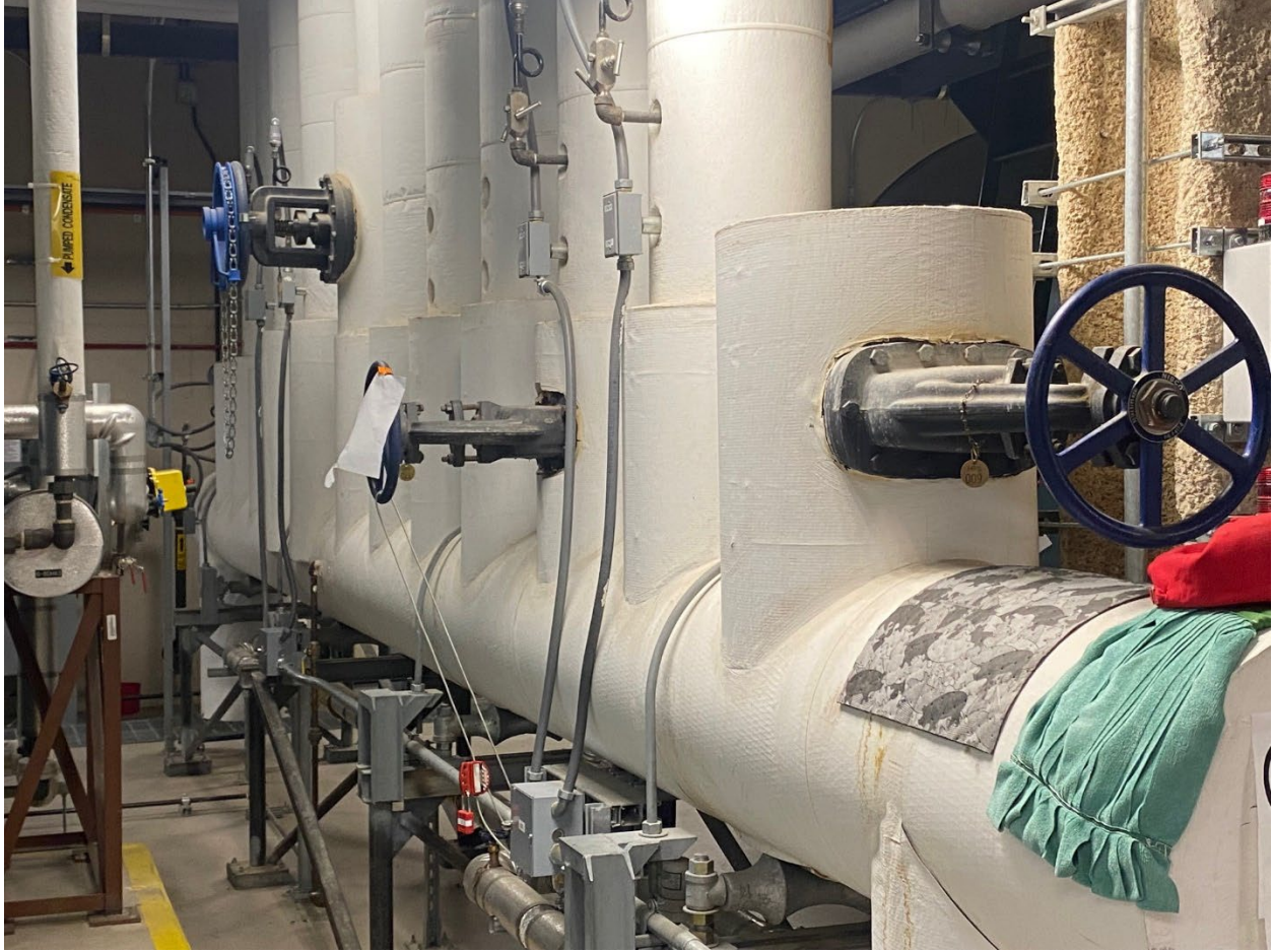
Figure 3: Steam Header Left Side