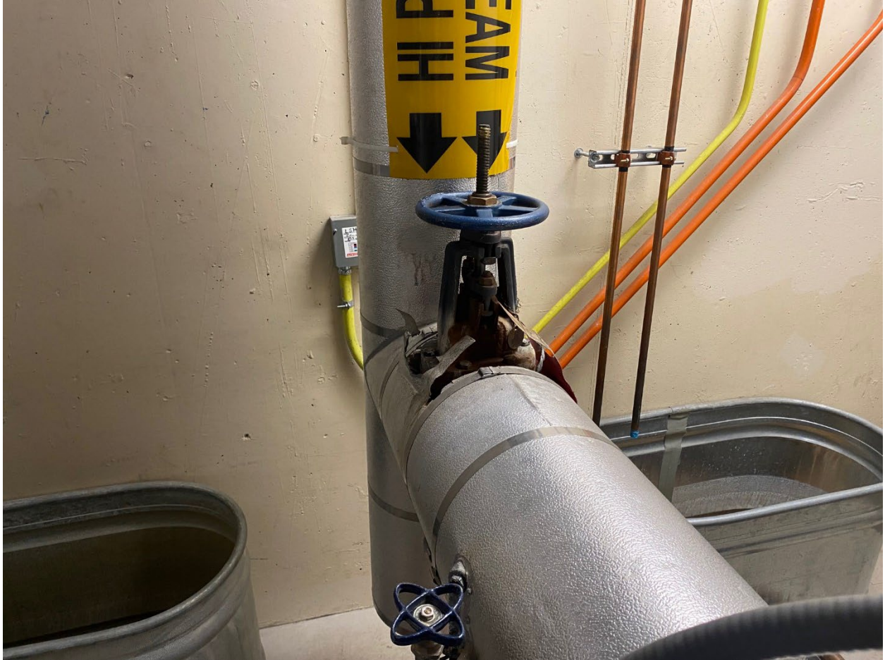
Figure 11: 6-DHX-3 Steam Isolation Gate Valve and Y-Strainer